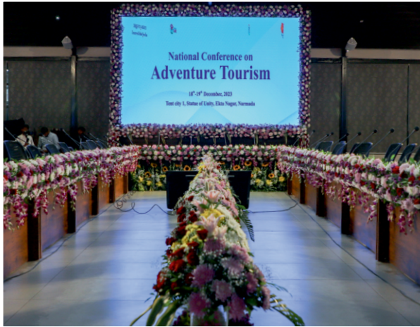
State-of-the-Art Conference Facility